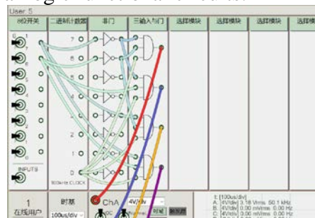
Fig. 3 “Digital electronic technology foundation” logic function circuit wiring diagram of netcircuit labs teaching experiment cloud platform

As shown in Figure 3 below, it is the logic functional circuit wiring diagram of “digital electronic technology foundation” and “analog electronic technology foundation” of netcircuit labs teaching experiment cloud platform. Figure 4 shows the output results of logic functional circuits of “digital electronic technology foundation” and “analog electronic technology foundation” of netcircuit labs teaching experiment cloud platform, which are used to demonstrate the working principle and operation results of combinational logic functional circuits.