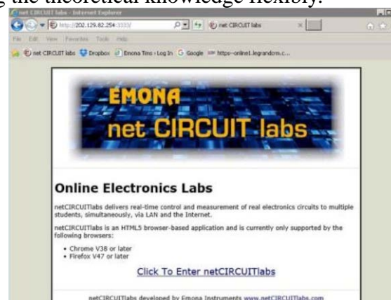
Fig.1 Remote Login Web Page of Netcircuit Labs Server

Through online remote access to the netcircuit labs of Emona on the computer of multimedia classroom, the new electronic technology teaching experiment cloud platform of virtual reality combination is demonstrated in real time, such as the classic circuit composition, logic and analog circuit function of “digital electronic technology foundation”, “analog electronic technology foundation” and other courses, so that students can have an image and intuitive for the abstract theory and circuit function The knowledge and understanding of the course will help to strengthen the students' deep understanding and application of the theoretical knowledge they have learned, greatly improve the teaching effect and efficiency, and improve the students' engineering practice ability of learning and using the theoretical knowledge flexibly.